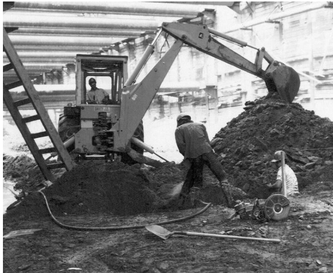
Braced cut in the construction of Washing, DC, metro, May 1974