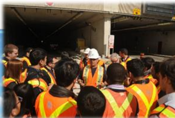
Pearson Airport -Engineering projects