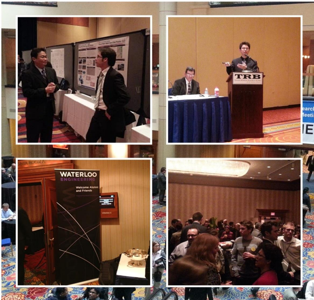
TRB 92 nd Annual Meeting- students' presentations (top), and TRB UW reception (bottom)

The UW-ITE has proven to be the leading chapter amongst others by actively producing research papers. In 2012-13, we have published nearly 80 journal/conference papers in the field of transportation.