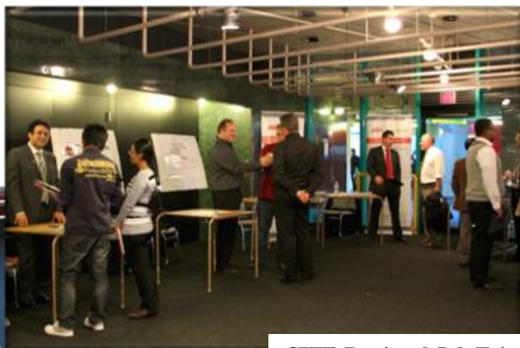
CITE Regional Job Fair