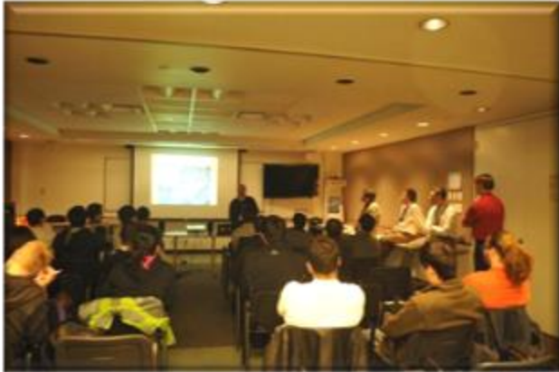
Presentations by Airport Engineering Team

UW-ITE Student Chapter organized a site visit during the last year. On Friday, Sept. 28 2012 around 25 members had a visit to the busiest airport in Canada, Toronto Pearson International Airport.