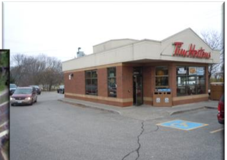
One of the data collection locations