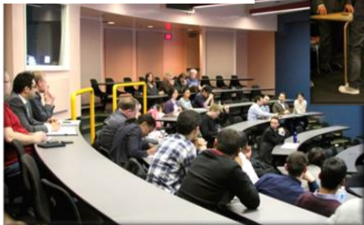
Student Presentation Competition

Beside the competition, four companies including CIMA+, Paradigm Transportation Solutions, Dillon Consulting, and MMM participated in the job fair at the University of Waterloo. Students took this opportunity to explore their potential future careers in these companies.