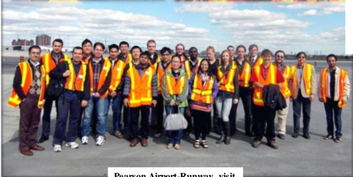
Pearson Airport-Runway visit