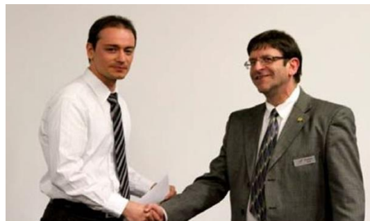
Awards Received by UW-ITE Student Chapter members