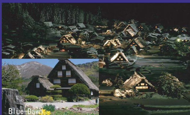
Village of Shirakawa