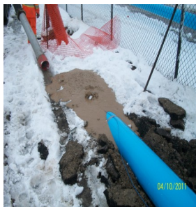
HDD Pipe pullback in process.

The successful contractor was A. van Egmond Construction Ltd . At the outset of the project, the contractor mobilized to site with a portable drilling rig, supporting grout truck and PVC fusing apparatus. The project commenced in March with the setup of a temporary shelter in the project staging area that allowed increased environmental control during the pipe fusing process. The contractor’s plan was to complete the watermain installation in three pulls. The first two consisted of 12 sections of 300mm diameter DR18 PVC pipe being fused together for a total pipe length of 146.4m. A third pull was implemented for the trenchless 200mm diameter water service installation (crossing Columbia Street).