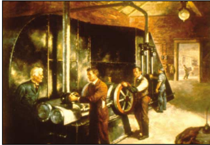
First air-conditioning plant at Brooklyn, N.Y., printing company.

Carrier’s dehumidification plant was intended to condition the second floor