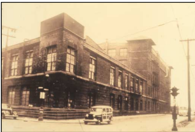
The Sackett-Wilhelms Printing and Publishing Company in Brooklyn, N.Y.

The Sackett-Wilhelms installation has been touted as “the first scientifically designed air-conditioning system” or even “the first air-condition-