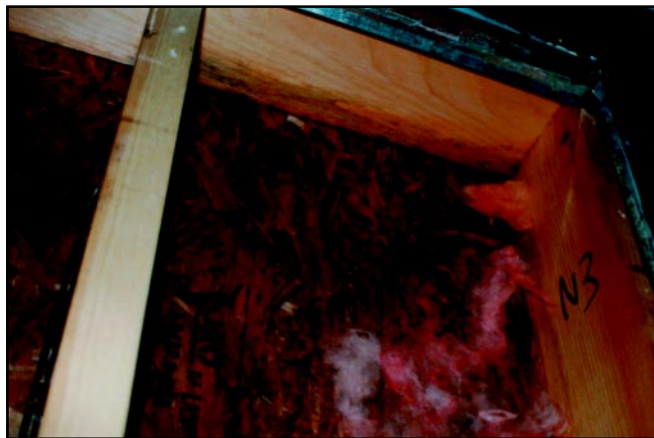
Water vapor has bypassed the vapor impermeable interior glazing unit (by convection through small flaws in the caulking) and condensing on the exterior pane of this window in winter. The same phenomena occur within walls and roofs as in the wall at right.

closure where it can sometimes condense. To control this flow, vapor barriers are often specified (on the inside in cold climates and on the outside in hot-humid climates), although vapor diffusion is not usually the cause of moisture damage in walls. That vapor diffusion was not a powerful transport mechanism in practice was first recognized as early as the 1950s, 6 and taken into practice by the mid-1980s in Canada by publications for practitioners. 7