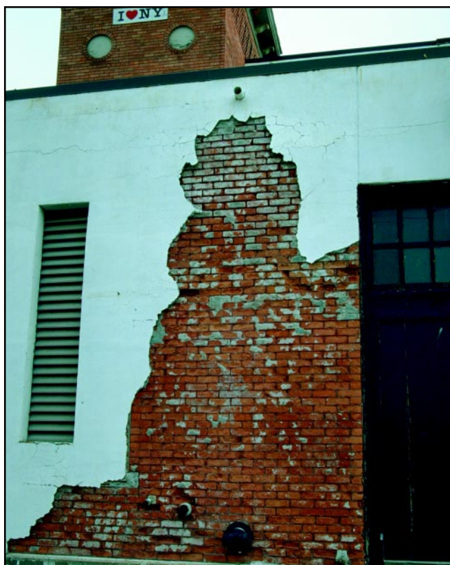
Rainwater drained from the roof onto the wall was absorbed into the brickwork, allowing freeze-thaw damage to occur.

Built-in moisture can be important, but this source is specific to the type of building construction and only plays a role for the first few years of a building's life. Wood framing typically loses close to 10% of its weight in moisture. A normal concrete mix contains about 200 kg (440 lb) of water per cubic meter, of which about half is later released as vapor. Hence, a typical house basement system containing 20 to 30 m 3 (700 to 1050 ft 3 ) of concrete will release several thousand liters of water over the first year or two. Similarly, a 200 mm (8 in.) thick reinforced concrete floor slab in an office building can be expected to release 20 liters per m 2 during the first two years. Concrete block (and water trapped in the cores during construction), drywall compounds, paints, flooring adhesives, etc., all contribute to built-in moisture.