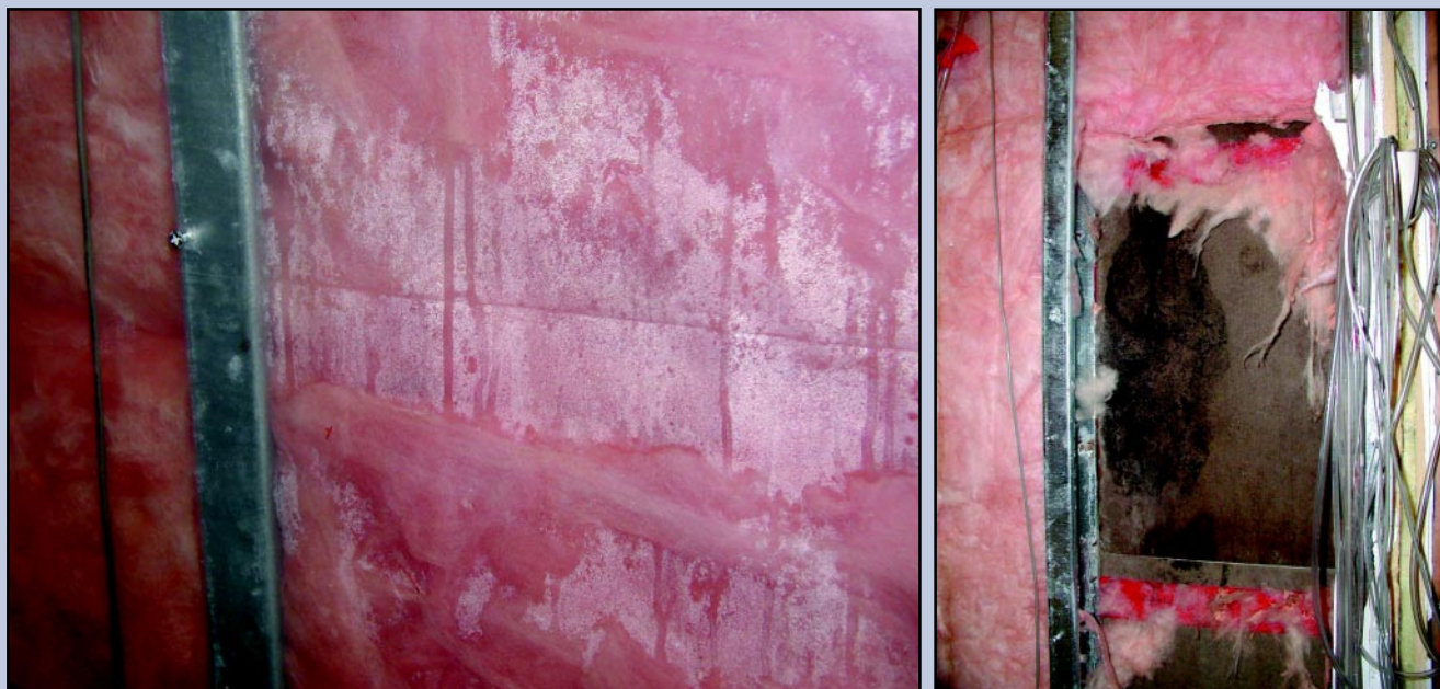
Water vapor diffusing inward during summer conditions in a cold climate (Waterloo, Canada) condensing on a low-permeance vapor barrier. The resulting damage is shown at right.

source may be the soil in this case, although understanding the whole moisture transport process can provide the designer with a number of interventions: a ground soil cover, a powerful dehumidification system (or ventilation in some climates), insulated piping, etc.